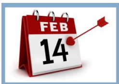
Happy Valentine's Day